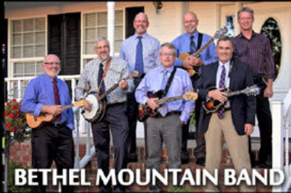
BETHEL MOUNTAIN BAND