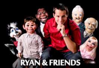
RYAN & FRIENDS

$599 PP 3RD/4TH $399 CHILDREN: FREE-$249