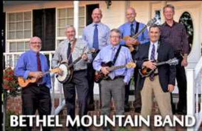
BETHEL MOUNTAIN BAND