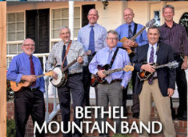
BETHEL MOUNTAIN BAND