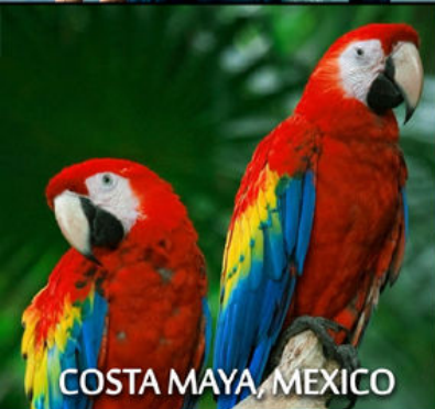
COSTA MAYA, MEXICO